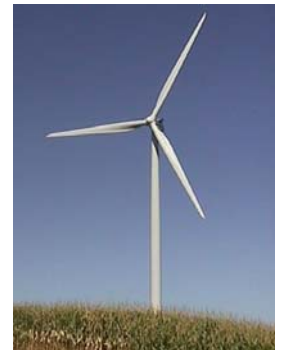
Photo: 1.65 MW Wind Turbine Carlton College, Northfield, MN