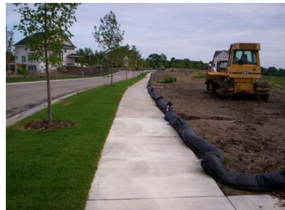
Wood-chip filled bags and sod are excellent perimeter control protection BMP's as seen here in the Lake Medina development.

Minnesota Pollution Control Agency — www.pca.state.mn.us/water/stormwater/stormwater-c.html#specialwaters